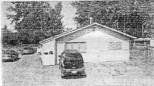
1706 Thunderbird Place